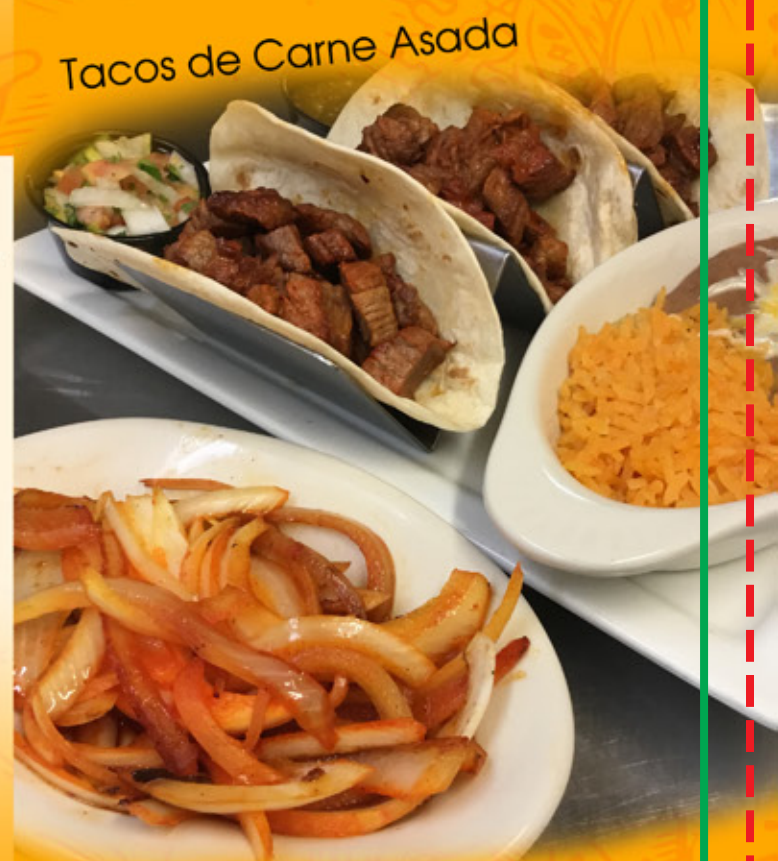
Tacos de Carne Asada

Large flour tortilla stuffed with melted cheese, onions, zucchini, red and green peppers and black beans and topped with California chili and cheese sauce. Served with rice, roasted corn salsa and drizzled with sour cream - 8.79