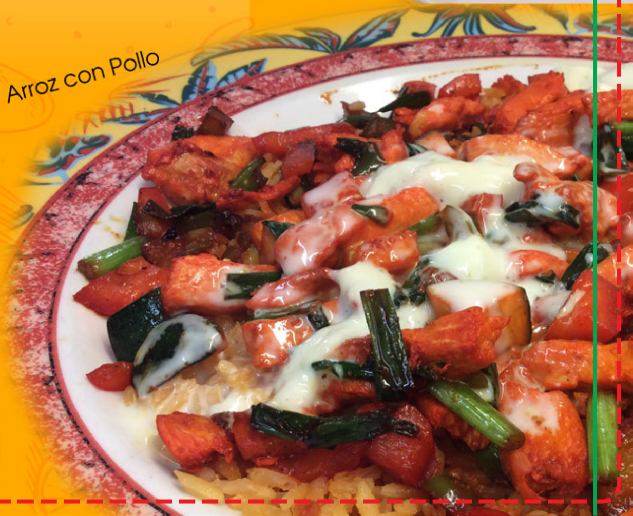
Arroz con Pollo